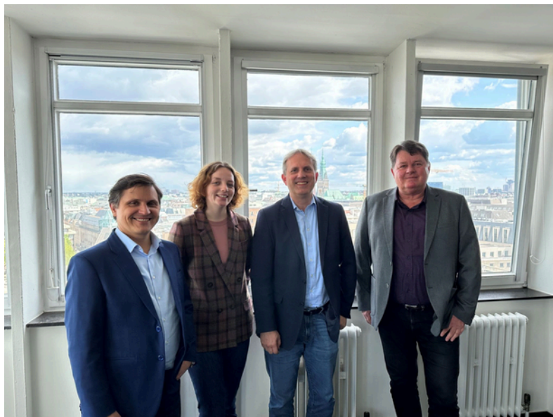
National Workshop participants in Germany

The consortium would like to thank all three national workshop participants for their active participation during the workshop and their overall involvement in the project!